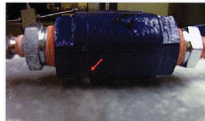
Figure 3A: Failure mode of Sample# 13-06-C0161-2, Body fractured at 6,613 psi.