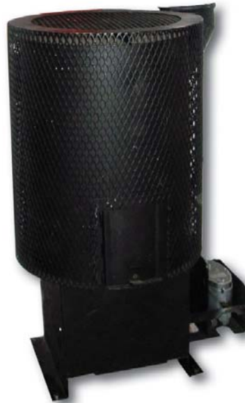
Northern Lights Camp Heater