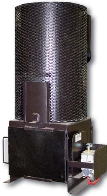
Standard Camp Heater